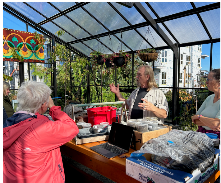
Workshops - Fruit Tree Pruning w/ Connie Kuramoto, Pollinators w/ Howie Abel, Soil building and advanced composting w/ Al Chomica