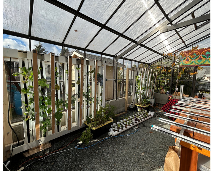
Other work completed - Springford Family harvest table, new shed, mounted vertical hydro units