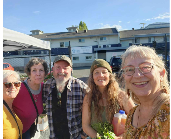
Events - Greenhouse Grand Opening, Musical guests at our Raffle / Apple Festival, more happy guests at the Raffle